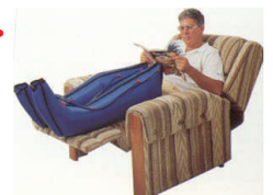
Foot and Leg Therapy

Made of high quality 200 Denier Nylon Oxford coated with 3 mils of Polyurethane Available in a variety of sizes and styles including